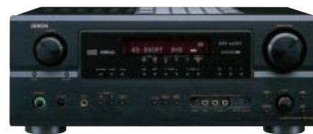
*Black version is available

*Design and specifications are subject to change without notice.